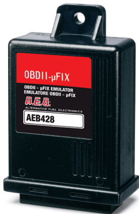
OBDII - μFIX Emulator